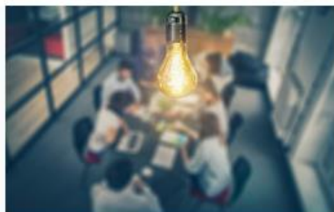
Support Categories & Benefits