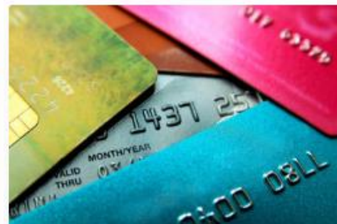
Cancellation Terms & Conditions

For further information, pricing and booking form, please contact: