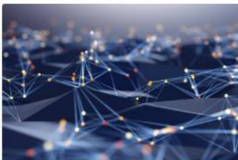
Past Event Statistics