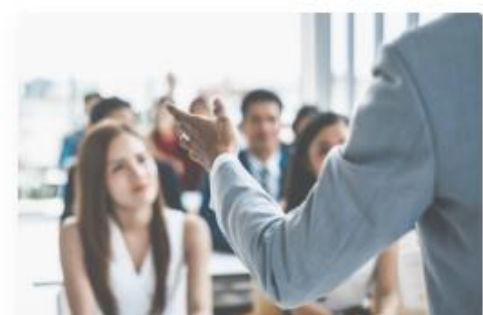
Educational Support Opportunities